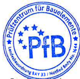
Stephanskirchen March 03, 2020